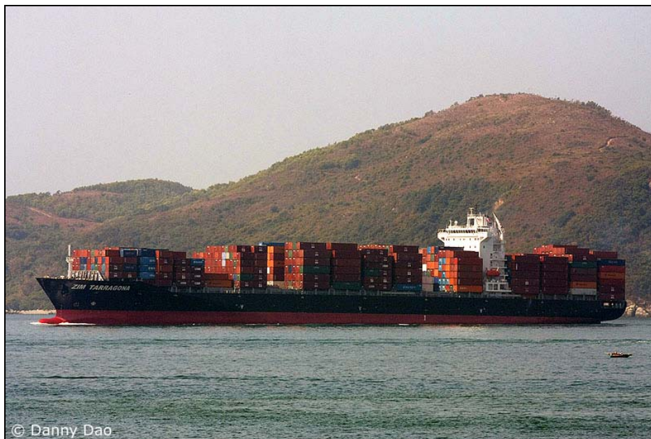
Photo 2 – Zim Tarragona (IMO 9471214), owned by the Israeli company ZIM Integrated Shipping, transported 117,585 kg of small arms ammunition (including tear gas ammunition) in 8 voyages in 2012, from New York to Haifa.

Credit: The Zim Tarragona, photographer Danny Dao, www.containership-info.com