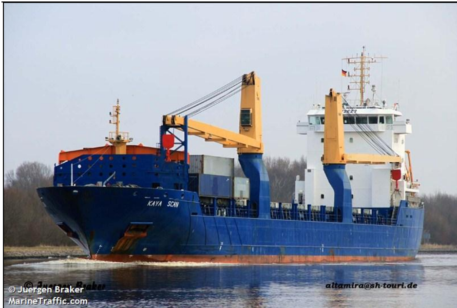
Credit: The Kaya Scan in the Kiel Canal, February 27, 2013, by Juergen Braker

Photo 1 – Antigua & Barbuda-flagged Kaya Scan (IMO 9570620), owned by Concord Shipping, Germany. On December 21, 2012, the ship departed Wilmington (NC) and arrived in Casablanca, Morocco on January 5, 2013. The cargo destined to Morocco included 3,127 tons of cartridges .