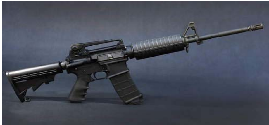
Photo 3 - A Bushmaster, similar to the one used in the Sandy Hook elementary school shootings (Newtown, CT) that left 20 children and 6 adult staff members dead on December 14, 2012

Source USA TradeOnline for HS codes 9303 (9303100000, 9303200030, 9303200035, 9303200080, 9303303020, 9303303030, 9303307010, 9303307012, 9303307017, 9303307025, 9303307030, 9303904000, 9303908000)