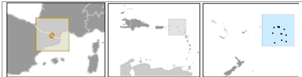
Map 1 – From left to right, location of Andorra (between Spain and France); Anguilla (East of Puerto Rico); and Cook Islands (North-East of New Zealand).